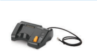
Single-bay Ethernet Cradle