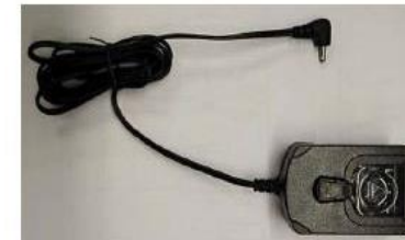
PWR-WUA5V4W0US Power Supply 5.2v, 1.1A